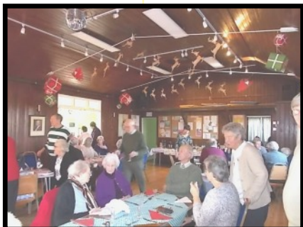
Gathering for the buffet