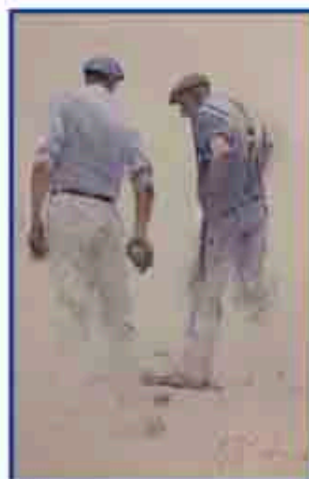
Flat caps not obligatory!