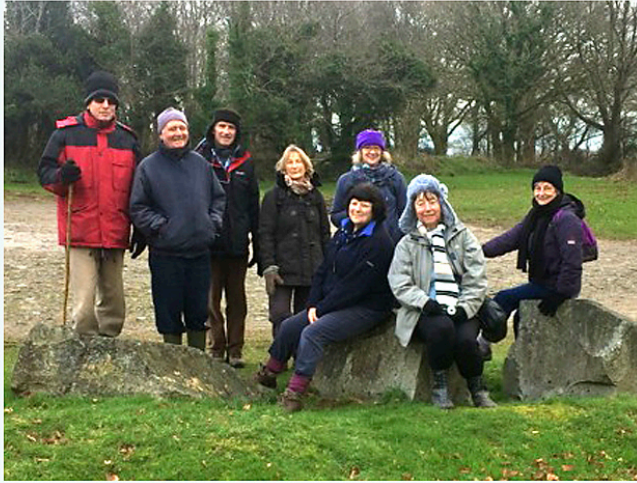
Finally, lunch at the Rifle Volunteer