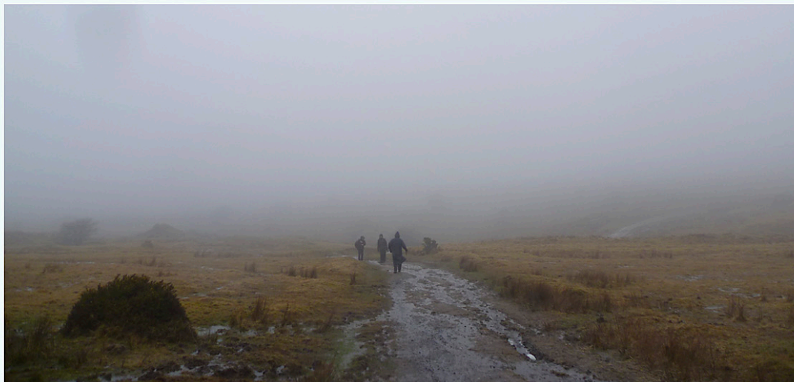
More atmospheric pictures from the walk!