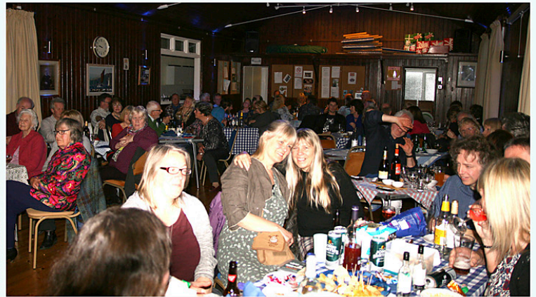
Expectant Punters arrive and settle in