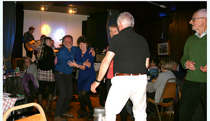
We couldn't stay seated for long!