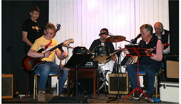
Tuning up instruments etc