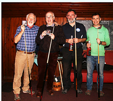
The Plate Finalists