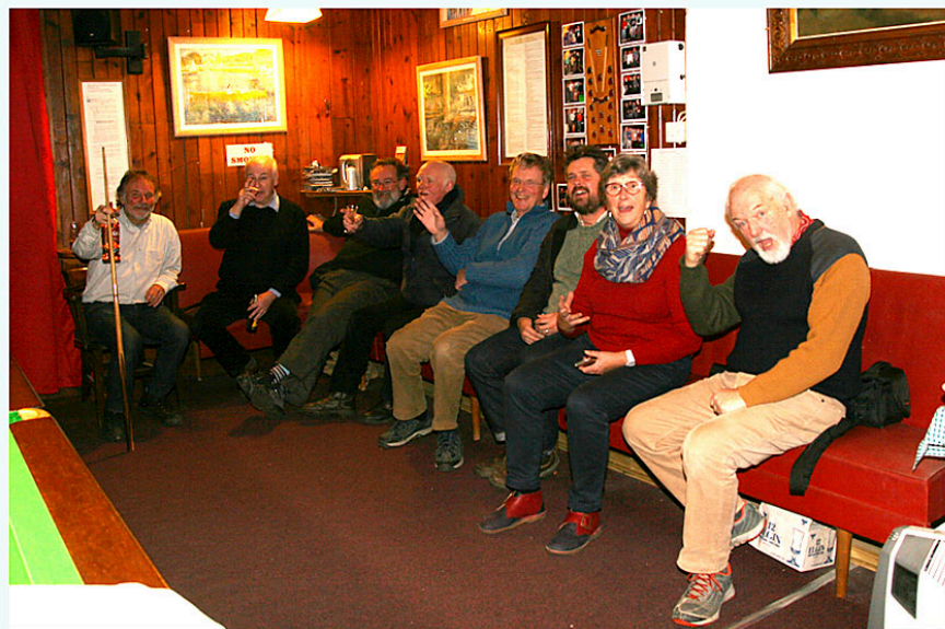
....some of the rowdy spectators