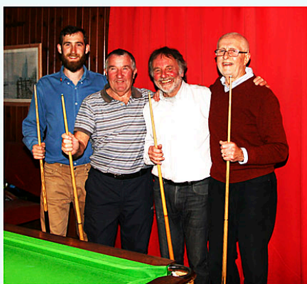
Main event Finalists