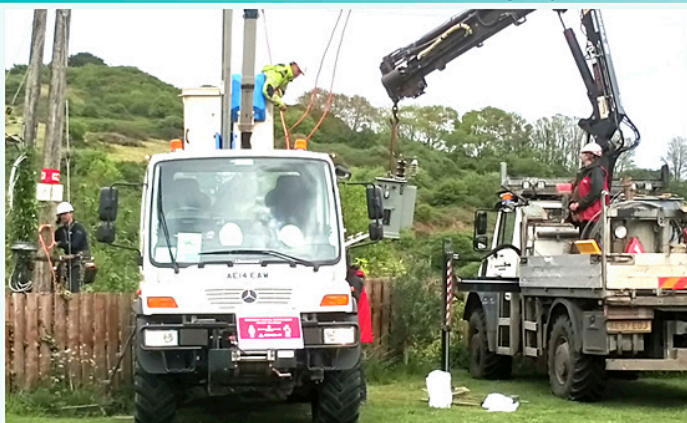
Here are some pictures of the faulty transformer being changed at Vanderbands Farm substation and the temporary generator opposite the Village Hall.