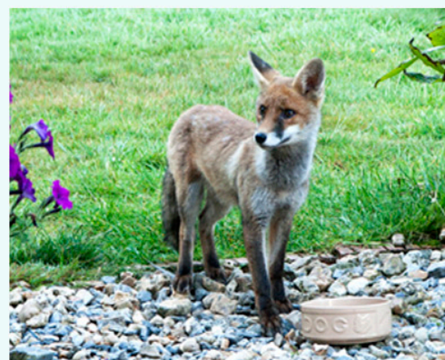
taken Wed this week.