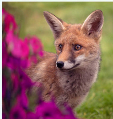
Jess showing off again!