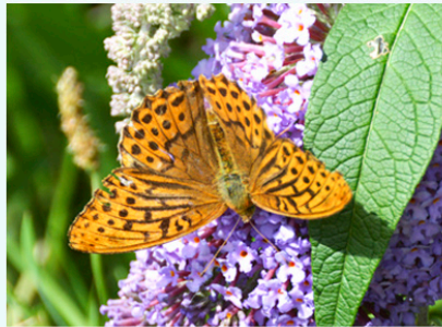
Pearl Bordered Fritillary.

Want to help monitor the health of our environment by sitting in the sun for 15 minutes? Join the Big Butterfly Count from now until August 9th . Check the website for a free identification app or chart and to find out how to enter your statistics.