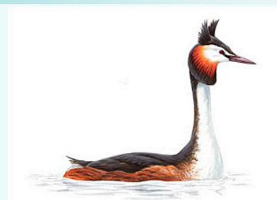
Great crested Grebe.

Glad to report the occasional Red Kite is still being seen flying over Cornwall.