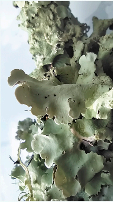
foliose lichen -

Do we live in a temperate rainforest (also known as Atlantic Woodlands)? A globally rare habitat characterised by high rainfall and mild humid conditions. They are found in the SW and can be internationally important for their lichens, mosses and liverworts .