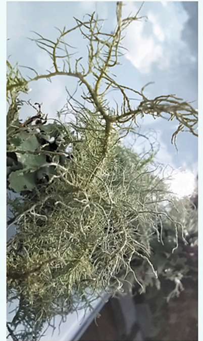
bearded or fruticose lichen

They fall into 3 growth forms, crust-like (common on grave stones and bare rocks) foliose (leaf-like) and the branched or fruticose. This last group are most sensitive to air pollution so their presence usually indicates pure air and also of particular importance, ancient woodlands.