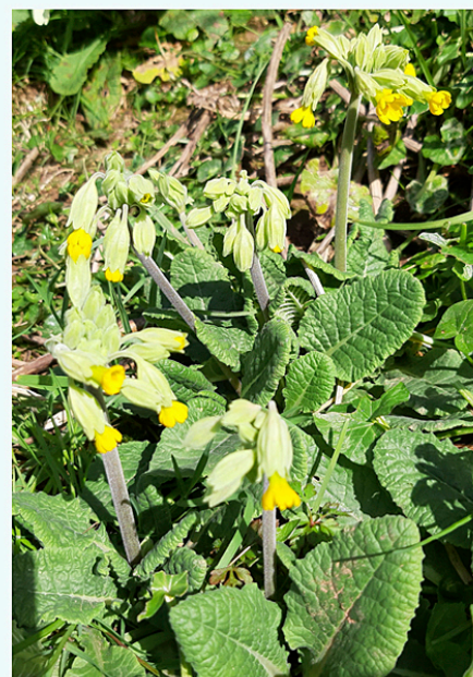
"grand parent" of primrose dynasty.

Soon Bluebells will be out too. Half the world's population grows in the UK. However, hybridisation between our native wild species and the more upright Spanish bluebell has caused concern amongst botanists, many advocating eradication of the latter, as it both interbreeds and outcompetes with our native species. In Cornwall Bluebells are at their southern limit of distribution. Could some Iberian genes prove beneficial as the climate warms or could we lose those amazing scented woodland carpets?