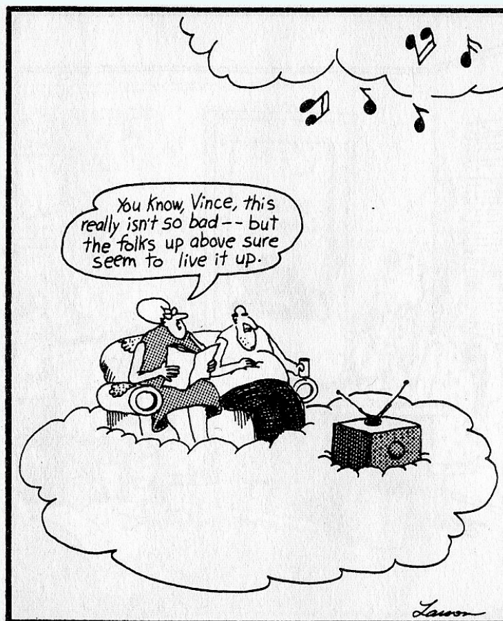
Life on cloud eight