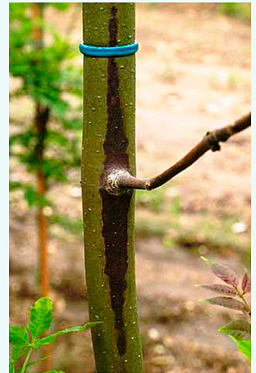
chalaria symptoms diamond- lesion

It is the seed gathering season and the Tree Council are encouraging us to collect and plant wild tree seed between 22nd September and the 23rd of October. It seems we will be losing even more Ash to Chalara the ash die back disease. It was confirmed in our area in 2017.