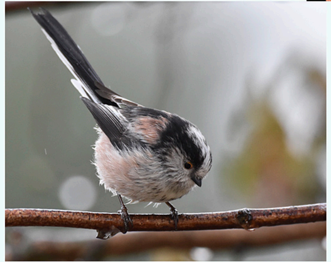
Long Tailed Tit

For further information on protecting nature and fighting Climate Change see the excellent booklet produced by Maker with Rame Parish Council, Green Rame .