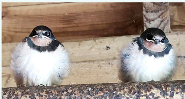
Baby Swallows

On the RSPB website you can find the Arrivals board showing when common birds arrive, but there are often unexpected species to be spotted.