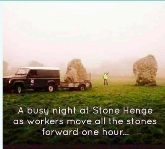
A busy night at Stone Henge as workers move all the stones forward one hour...