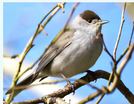
black cap

The countryside is now flooded with early flowers providing food for pollinators emerging from hibernation, it seems however, that bees are not keen on daffodils and tulips, which begs the question what is pollinating them? Have you spotted any likely candidates?