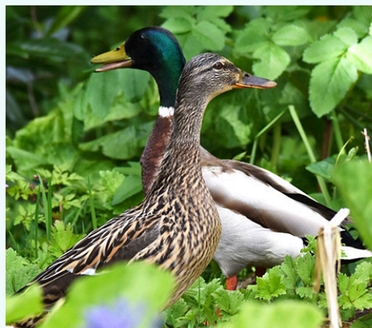
Mallard ducks.

As summer migrants start to arrive in St John and nest building is underway for many species, it is the breeding success of our local Mallards that has been the most notable in the last month. There have been several reports of ducklings in garden ponds and streams including our own. And squadrons of Mallards flying past regularly to enjoy Lynne's snack bar.