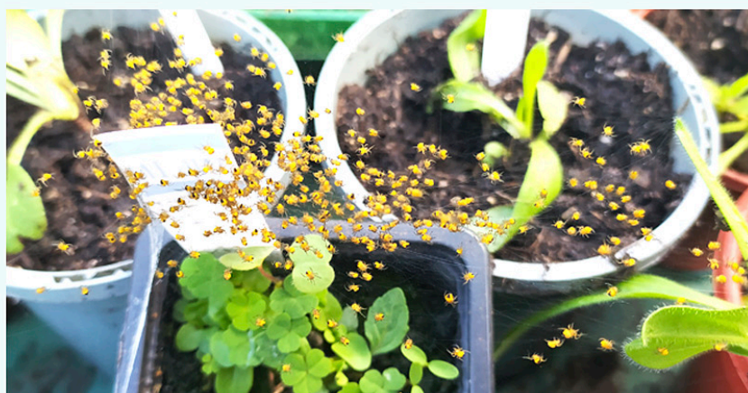
Spectacular spider hatch-lings (bumper year for them!)

Spuds in a bucket. Hope your plants are doing well, mine were caught by an unexpected frost but have since rallied. There have been some impressive specimens spotted in greenhouses, however. Anyone discovered Paddy's secret formula of success?